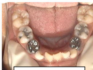
#26 is impacted

are told that space usually exists between the lower incisors so that when the large canines come in they push all that space closed. Now, if there is no space present, we ask the parents, “what do you think is going to occur when the canines come in?” The parents always state that the canines will crowd things up. Then, we ask, “if the lower incisors are already crowded, what do you think will occur when the canines erupt?” The parents always state we need to make more room for the canines.