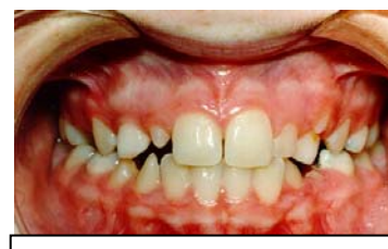
Small or pegged shaped lateral incisors