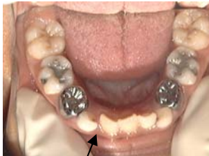
Impacted lower right lateral incisor