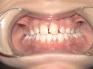
Upper narrow arch so narrow to cause severe midline shift