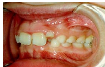
Class II division 2; deep bite