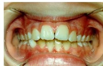
Narrow arches and overjet

The below are some types of cases that must be seen at early at age 7 so that a complete diagnosis and treatment plan can be formulated and the patient start treatment: