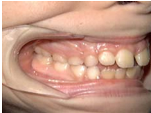
Upper and lower protruded incisors; tongue thrust