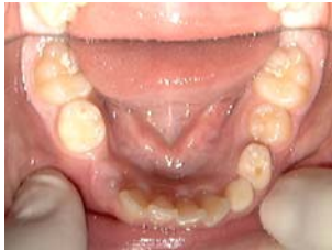
Lower anterior crowding