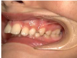
Severe overjet; severe protrusion of upper anterior teeth