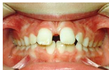
Strong frenulum; large diastema