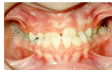
Anterior crossbite; upper jaw retrusion