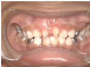
Upper supernumerary central incisors