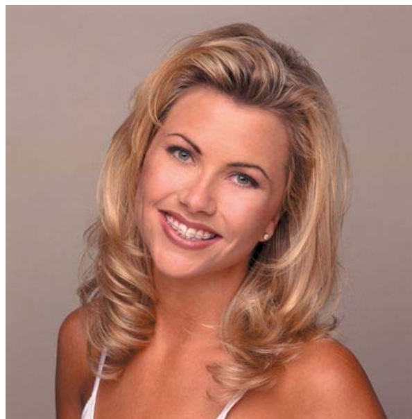
She has Clear Ceramic Braces!

For some, early diagnosis and early treatment may be appropriate. It is recommended that children get an orthodontic check-up no later than age 7. Adults may have special considerations that may require inter-disciplinary care, which, of course, would be coordinated by your family dentist. The goal of every orthodontist is to provide each patient with the most appropriate treatment at the most appropriate time. By working together, we (dentists and orthodontists) can give our patients beautiful, healthy smiles that are good for life!