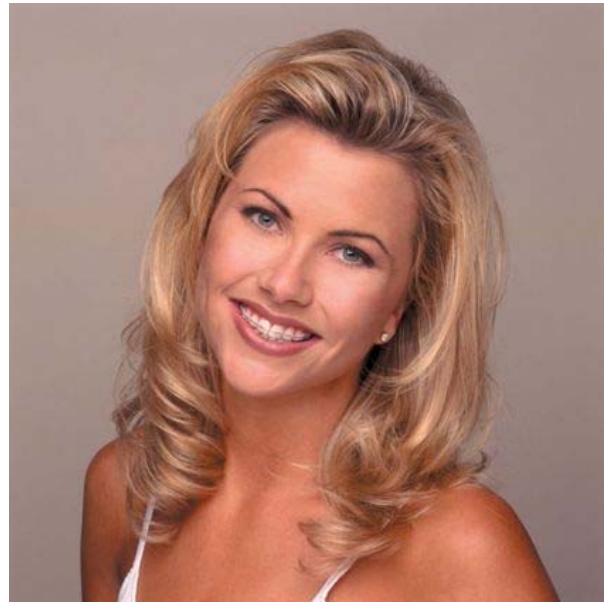
She has Clear Ceramic Braces!

For some, early diagnosis and early treatment may be appropriate. It is recommended that children get an orthodontic check-up no later than age 7. Adults may have special considerations that may require inter-disciplinary care, which, of course, would be coordinated by your family dentist. The goal of every orthodontist is to provide each patient with the most appropriate treatment at the most appropriate time. By working together, we (dentists and orthodontists) can give our patients beautiful, healthy smiles that are good for life!